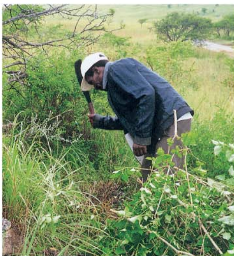
Mechanical control method- slashing