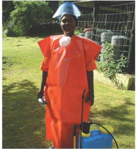
Chemical control - wear protective clothing

The correct choice of a herbicide is essential so do not be tempted to buy just because there is a “special” on offer! When selecting, take into account the important points as detailed below. Also see the summary in table 2 on page 14,