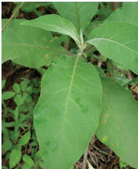
Spot spraying works well on young Bugweed plants

Spot Spraying Anecdotal reports suggest that spot spraying with 0.5% triclopyr EC with 0.5% wetter in water is an effective spot spraying mixture for Ageratum, Balloon vine, Blackjack, Khaki weed and young specimens of Bugweed, Castor oil, Madeira vine and Triffid weed.