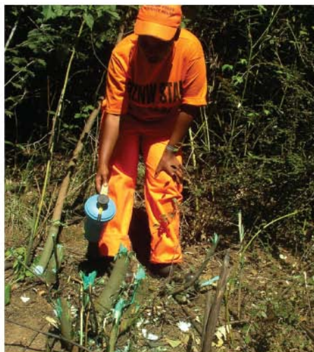
Cut stump herbicide application

Cut the plant as close to ground level as possible with a horizontal cut. Use a tool that will give a clean cut e.g. loppers for diameters up to 50 mm and a saw for diameters greater than 50 mm. The ideal stump is short, with a level cut-surface, none of the bark is torn away from the wood and there are no exposed roots. Remember sharp, angled cuts make the stumps hazardous. For cut stump, mix herbicide according to label and apply as soon as possible to the outer ring of the freshly-cut surface just inside the bark. If you are too slow, air is sucked into the sap vessels, preventing take-up of the herbicide. For multiple, small stumps with diameters less than 50 mm,